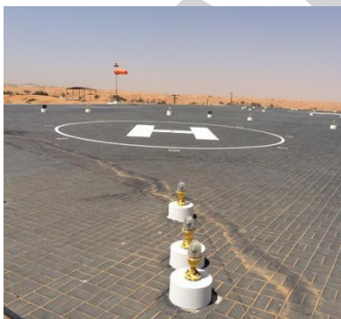
Heliport On Desert